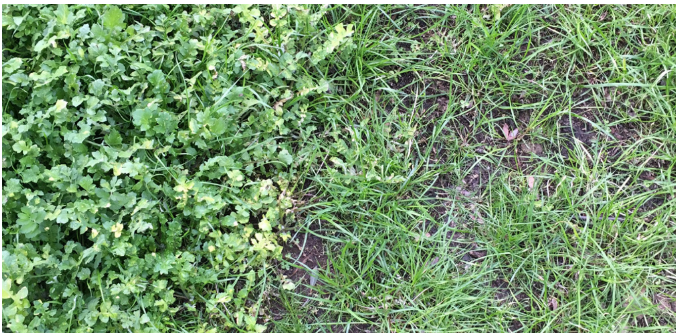
Removal of capeweed using broadleaf selective herbicide.

The success of selective herbicides depends on their ability to kill the target weeds such as barley grass, silver grass, soft brome grass, capeweed, thistles and erodium, while minimising damage to desirable species, such as phalaris, perennial ryegrass, cocksfoot, tall fescue and sub-clover.