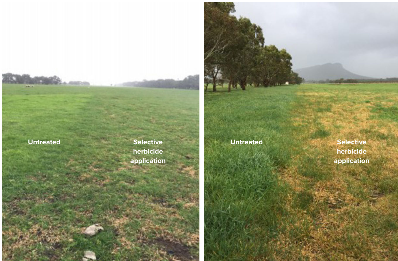
Phalaris pasture shows reduced damage when grazed and leaf area is reduced prior to selective herbicide application (left) compared to leafy ungrazed phalaris (right).

Herbicide manufacturers test products to determine crop and pasture safety. This information may be on the product label, can be accessed through manufacturers’ websites or on request from technical representatives.