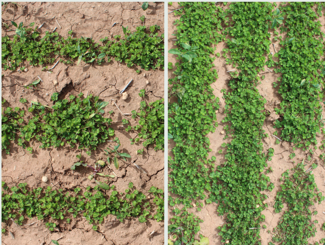
Two different registered 'clover-safe' broadleaf herbicides showing more suppression on Seaton Park sub-clover on left (active ingredient 2,4-D amine) than on right (2,4-DB) at label rates.

Some level of damage to the desirable species may occur from applying selective herbicides.