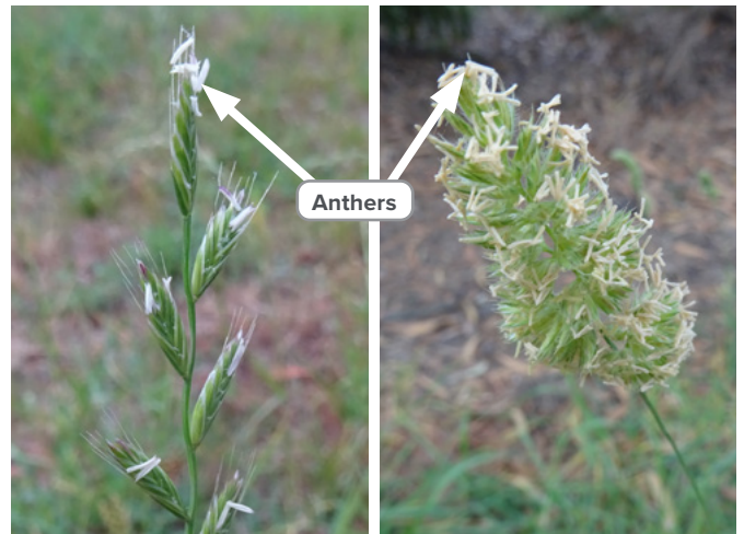
Flowering perennial ryegrass (left) and cocksfoot.

Time of flowering is cultivar and season-dependent, but typically occurs around mid to late November with seed ripening usually finished by early January. To identify flowering, inspect the seed heads and look for the appearance of anthers (flowers) on the plant.