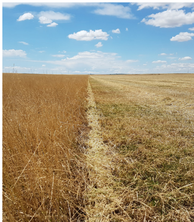
Slashing seed heads to bring seed to ground after ripening.

* Results based on crop seed production of 1.3t/ha perennial ryegrass and 0.5t/ha cocksfoot. In a mixed poor perennial pasture, it is estimated that seed yields could be approximately 10%. One kilogram of perennial ryegrass seed equals 320 seeds/m 2 and one kilogram of cocksfoot is 760 seeds/m 2 .