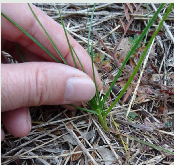
Gently pull seedlings to check anchorage.

To determine if the seedlings are well anchored and will not pull out when grazed, gently pinch the seedling between your finger and thumb and twist while pulling upwards. Well-anchored seedlings will offer some resistance and will not pull out easily.