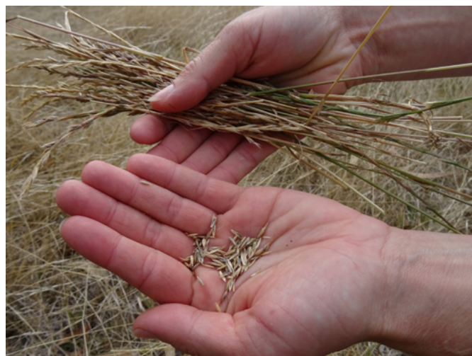
Demonstration of rubbing seed head (left) and inspecting seed in hand.

Maximising seed fall: Natural seed fall from the reproductive tiller requires the seed heads to become brittle. This may not occur for several weeks after ripening. To assist this process, the seed head can be disturbed to enhance seed fall.