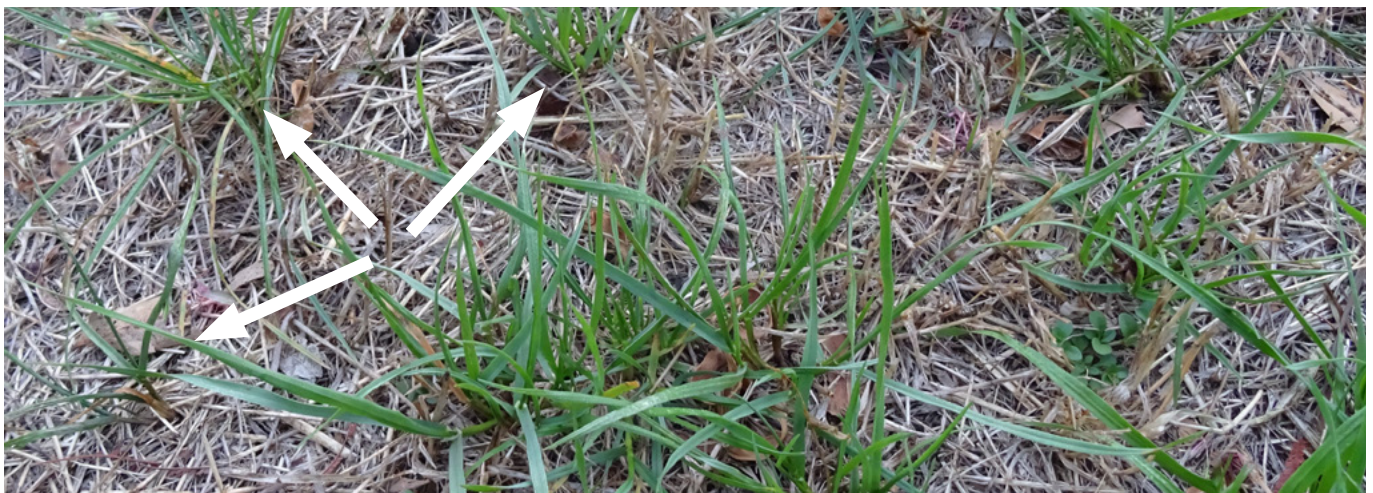
Recruited perennial ryegrass seedlings in amongst established plants.