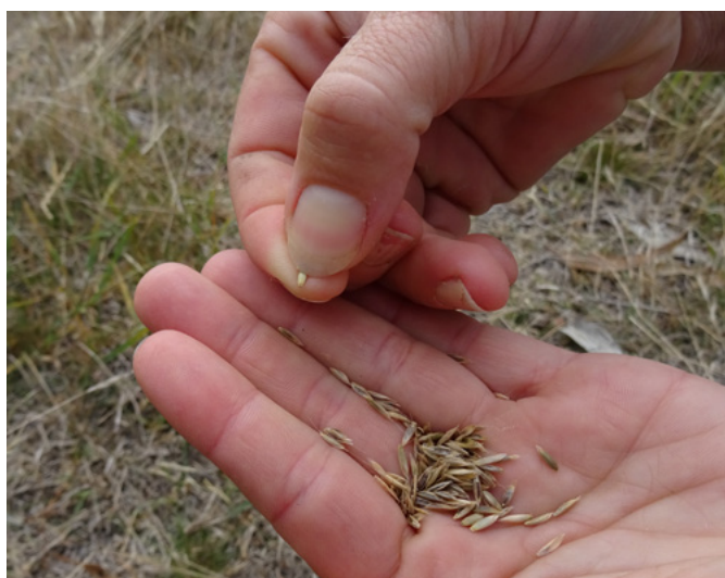
Checking if seed has ripened by squeezing the seed between your fingers.

Graze down to about 1,000kg/ha before the autumn break. This is equivalent to about one to two handfuls of dry loose material in 0.1m 2 (31 by 31cm quadrat).