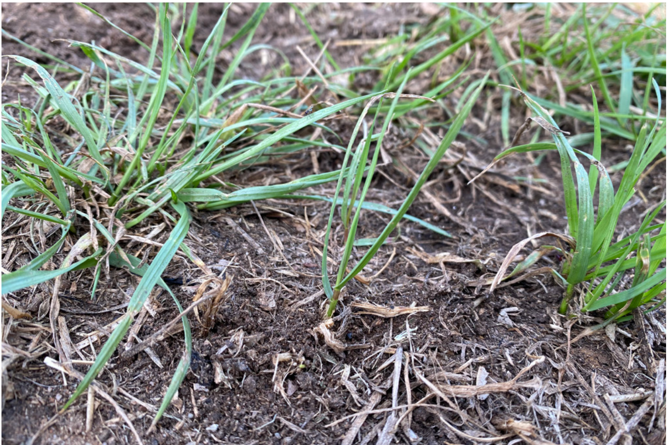
Recruited perennial ryegrass seedling in amongst established plants.

There are a number of ways producers can encourage seedling recruitment in their pastures and here we look at how seedling recruitment can be managed.