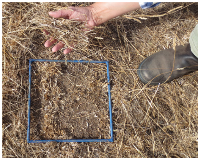
One handful of loose litter scraped up within 31cm square quadrat will allow seed germination.