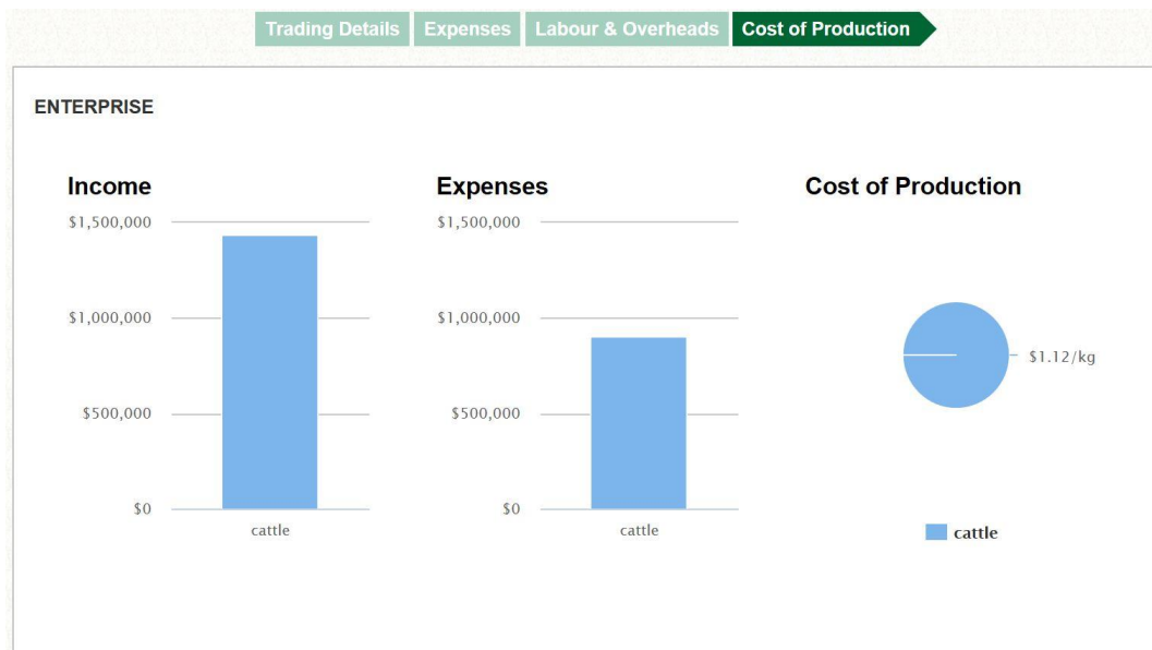
Figure 6: The 'Enterprise' pane shows relative income, expenses, cost of production

The 'Cattle' pane shows more detail and helps users better understand the cost of production of their beef enterprise (Figure 7). Beef cost of production is calculated as total cost of beef production divided by net kilograms of beef liveweight sold. The tool also provides the margin between beef price received ($/kg lwt) and beef cost of production ($/kg lwt).