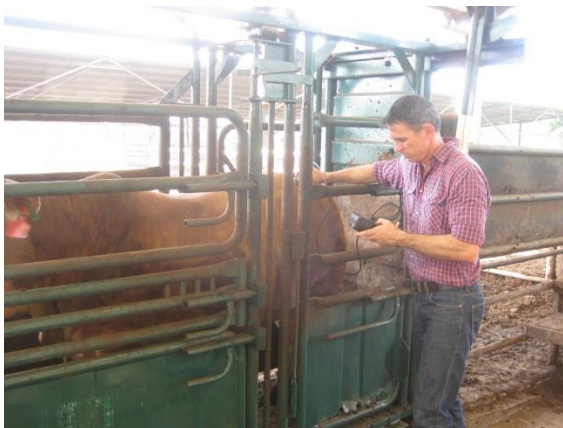
Photo 10. P8 fat depth being measured ultrasonically at the final data recording