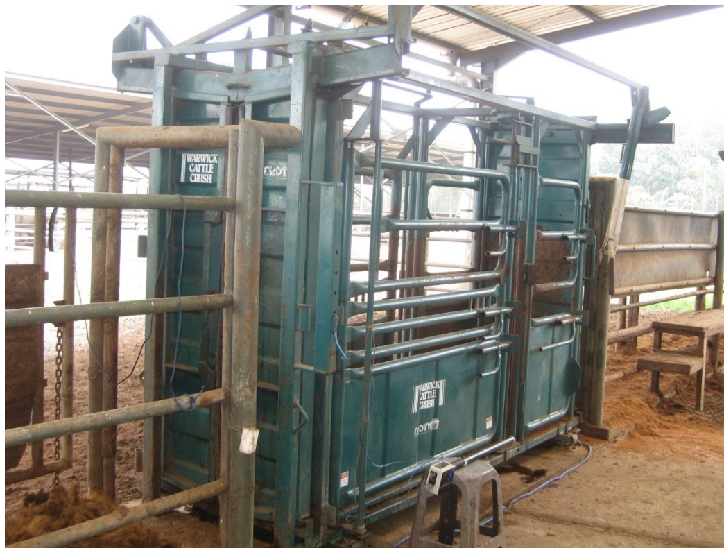
Picture 1. The crush where data was recorded at the Lampung feedlot