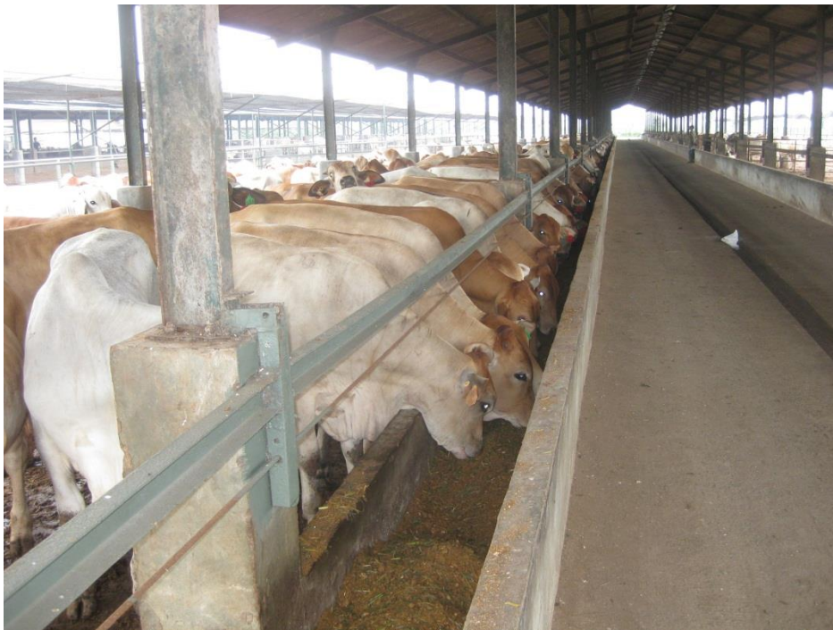
Photo 4. The steers feeding in their pen on the day after induction into the feedlot