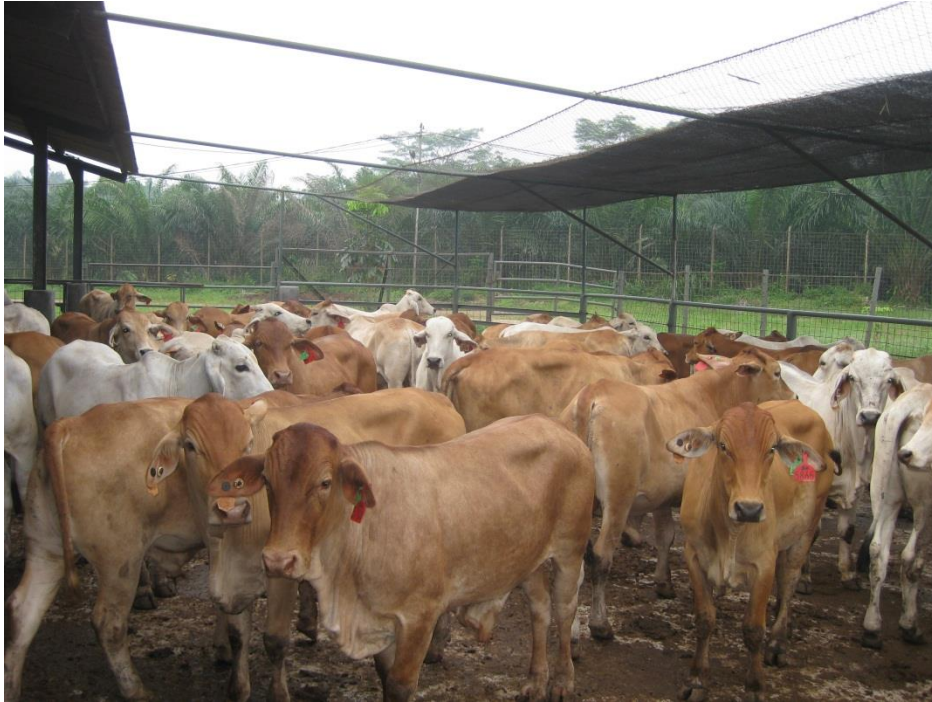
Photo 3. The steers at induction into the feedlot near Lampung, Indonesia