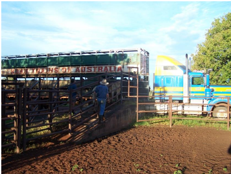
Photo 2. The steers being loaded at DDRF for transport to the Berrimah export yards