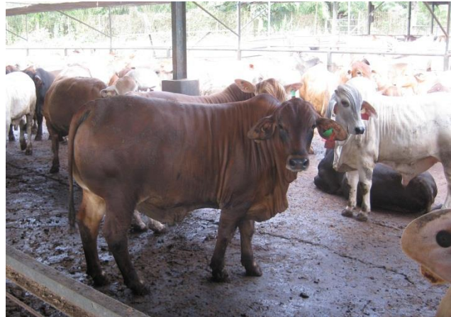
Photos 5 to 8. Steers in the Lampung feedlot on the day of the final measurements