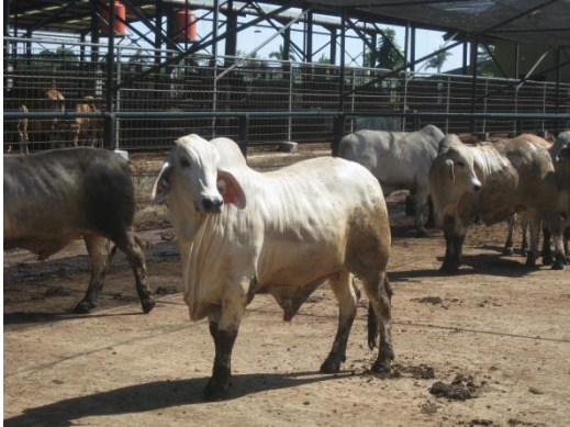
Photo 9. One of the Brahman steers on the day of the final measurements