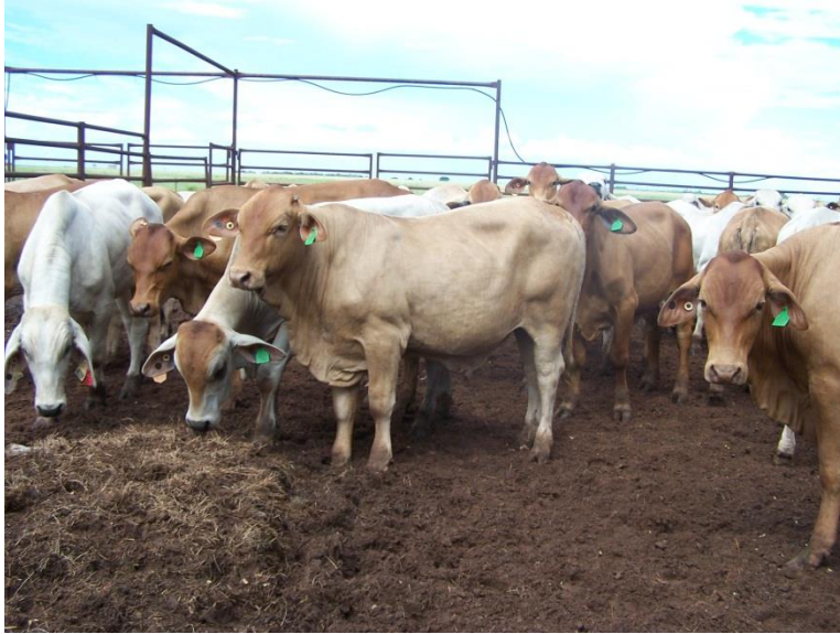
Photo 1. The F1 Senepol and Brahman steers at DDRF before trucking to the Berrimah export yards

Photos of the cattle at various times are shown below.