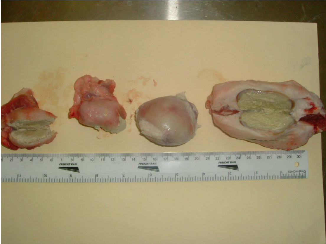
Figure 1. Two injection site lesions (on left) and two enlarged pre-scapular lymph nodes (on right) excised from merino carcasses 3 years following vaccination showing the nature of their contents.