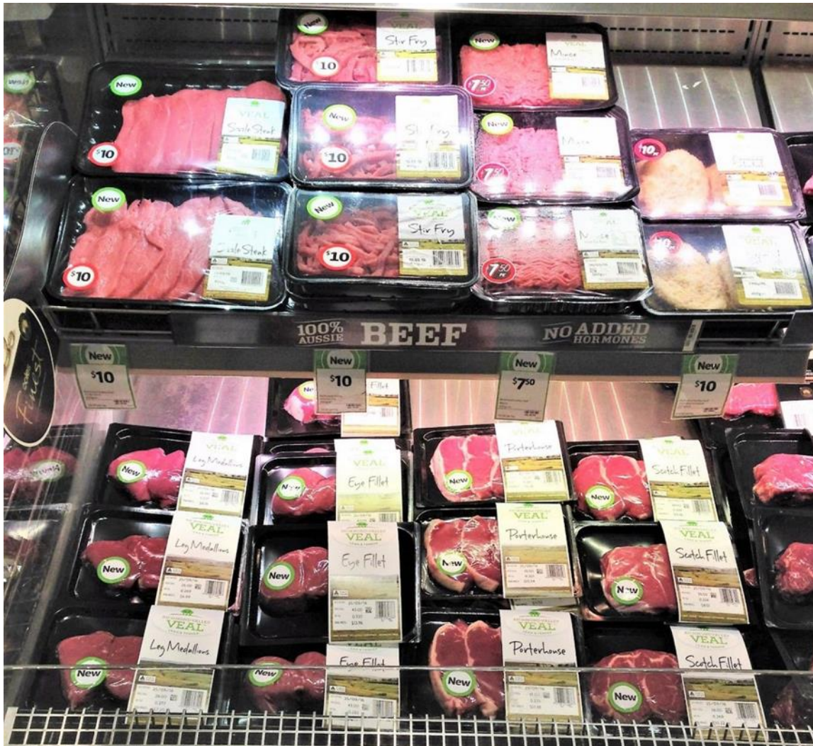
Fig 3. All SKUs in retail display cabinet