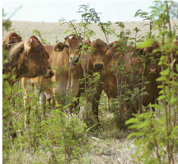
Leucaena stand planted in 1975 and grazed every year

Being deep-rooted, leucaena is able to exploit soil moisture beyond the reach of grass roots and so remain productive well into the dry season. Once established, leucaena-grass pastures can remain productive for over 30 years.