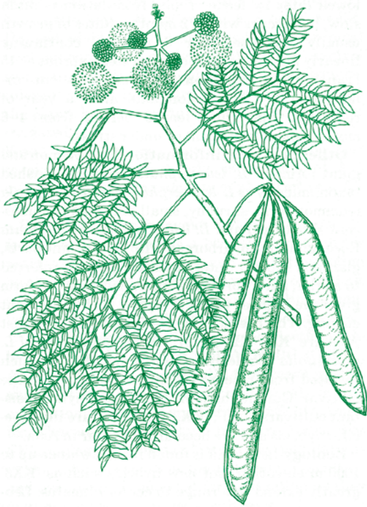
Leaves, flowers and pods of leucaena

Leucaena ( Leucaena leucocephala ) is a small-medium perennial leguminous tree with foliage of high nutritive value for ruminant production. It is palatable, nutritious, long-lived and drought-tolerant.