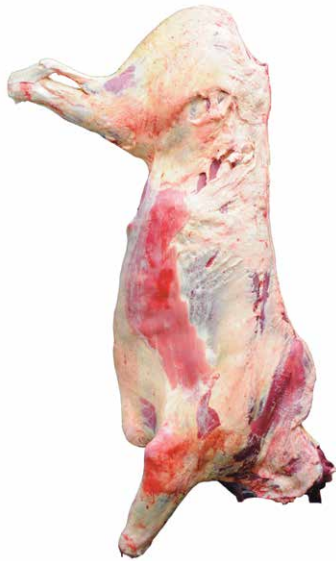
A tenderstretch carcass.

Example animal: Male; HGP treated; 250kg HSCW; ossification 170; MSA marbling 300; rib fat 5mm; pH 5.55; 90mm hump (50% TBC equivalent) and grill cooking method.