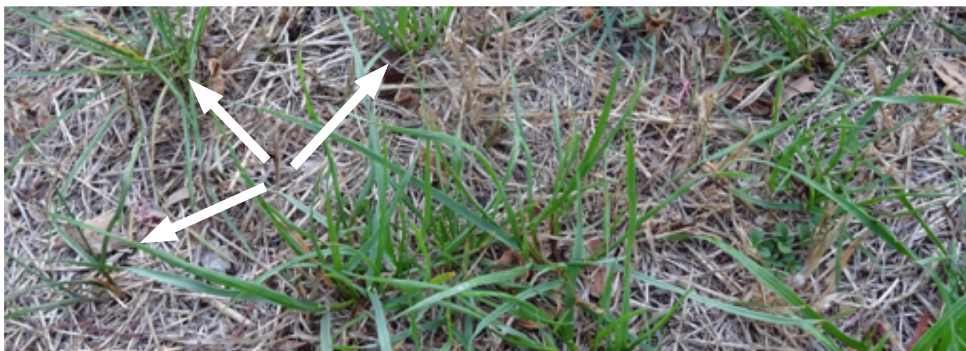
Recruited perennial ryegrass seedlings in amongst established plants.