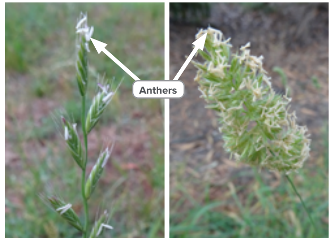
Flowering perennial ryegrass (left) and cocksfoot.

Time of flowering is cultivar and season-dependent, but typically occurs around mid to late November with seed ripening usually finished by early January. To identify flowering, inspect the seed heads and look for the appearance of anthers (flowers) on the plant.