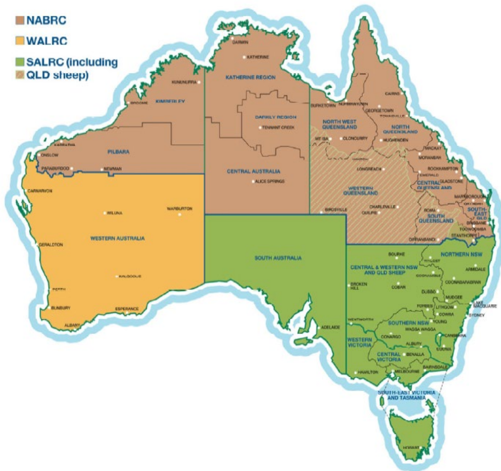
Climatic Zones Map