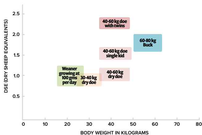
Image 2: DSE ratings for various classes and body weights of goats

As the key variable in a livestock production enterprise is typically the number of livestock rather than the area of land able to be accessed, it is advised to begin the consideration of stocking rate with an assessment of the carrying capacity of the land.