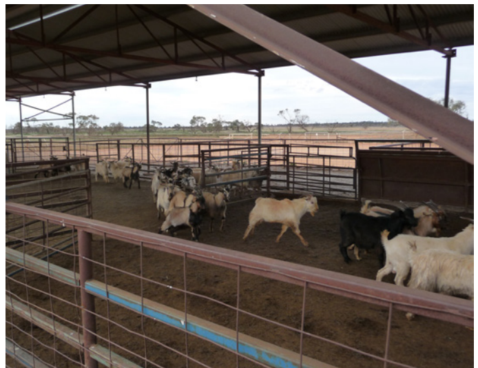
Adding weldmesh to rails can help keep yards 'goat proof'