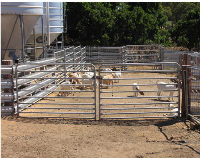
Making yards higher or adding extra rails can help make them 'goat proof'

Yard designs should encourage easy flow of goats with a minimum of pressure. Goats will pack together and smother so make sure they remain standing when being worked in small yards or handling races. If a yard looks over filled with goats then it's too full - reduce the pressure.