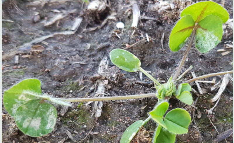
Redlegged earth mite damage on sub-clover seedlings.

Regular inspections should be made for pests, especially redlegged earth mite (RLEM) which hatch when there has been at least 25mm rainfall and average daily temperatures fall below 21°C.