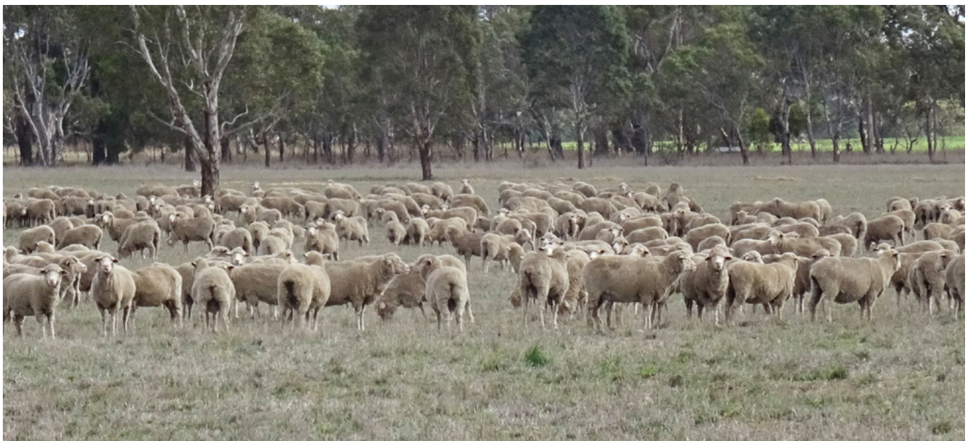
Grazing helps remove excess pasture litter to prepare the paddocks for sub-clover germination.

Source: Brogden, J (2019) The effect of trash on sub-clover germination. In '60th Annual Conference Proceedings'. Grassland Society of Southern Australia Inc. pp 86.