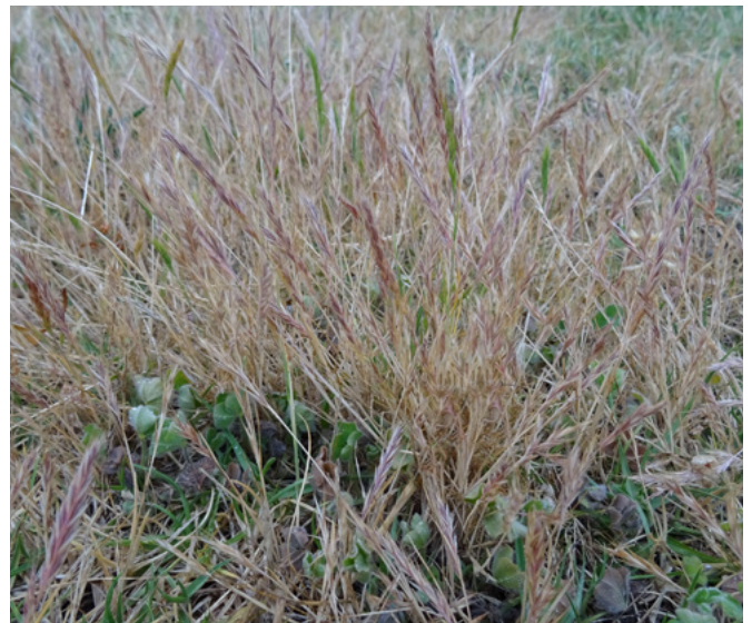
Dry silver grass will release a natural toxin that reduces the germination of sub-clover.

A compromise between protecting the soil, achieving hard seed breakdown and reducing the toxic effects is