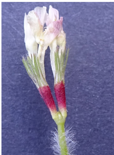
Sub-clover flowers on cultivar Mt Barker showing red pigment on the flower tube.

Sub-clover flowers are easy to observe. They are usually white and have three or four tubular florets. Different cultivars can have different markings, such as red pigmentation.