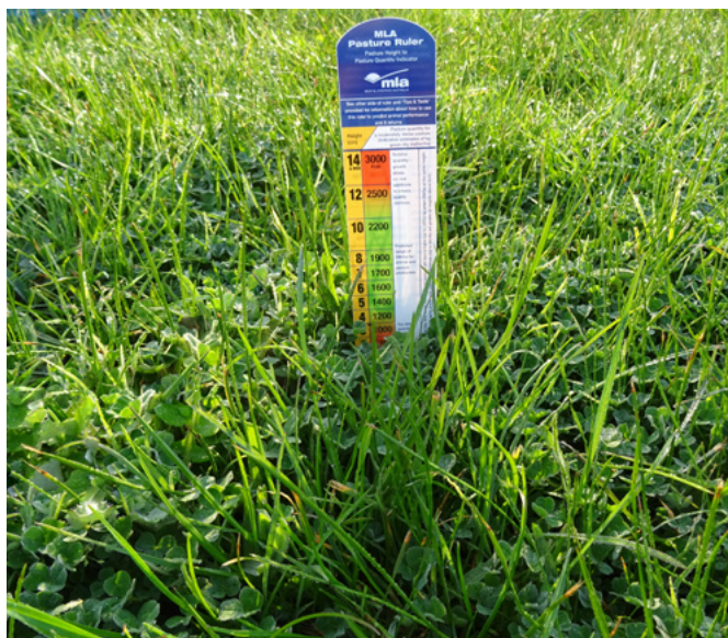
Compromised grazing height to suit both sub-clover and perennial grasses.

Intensive grazing does not need to be repeated each year, as the seed bank can build rapidly in a single season. Continual intensive grazing may also encourage the growth of broadleaf weeds such as capeweed and erodium. These weeds can be successfully controlled using spray grazing.