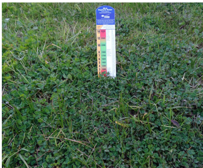
Grazing height to favour sub-clover over perennial grasses.

If more sub-clover is desired, grazing frequently and to 1,000kg DM/ha is necessary.