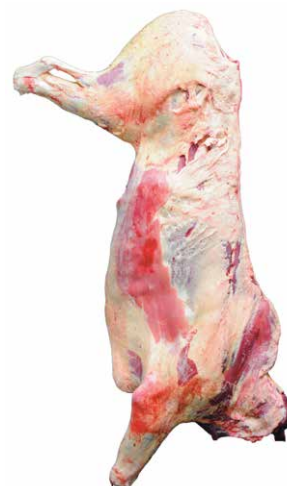
A tenderstretch carcass.

with the producer and will be influenced by the mix of production and eating quality effects and their economic impact.